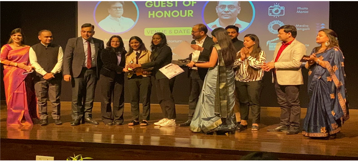
The Guest gave prizes to the Students of DIHE.