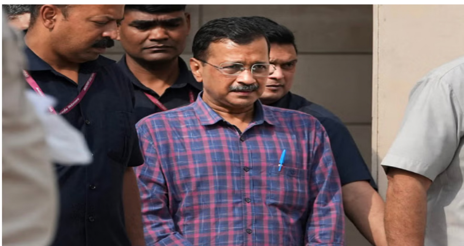
Representative image of Delhi Chief Minister Arvind Kejriwal being produced before the Rouse Avenue Court, in New Delhi, Friday, March 22.